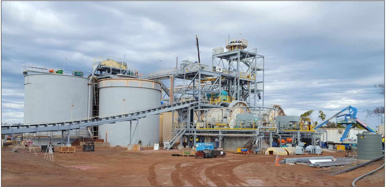
Refurbished mill feed conveyor, grinding circuit, new cyclone cluster, new gravity circuit (Nelson Concentrators coloured green) and preleach tanks.