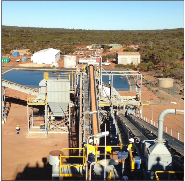
Overview of crushing circuit