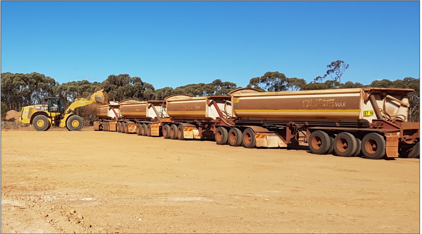
Loading of Siberia low grade ore at Siberia ROM for transport to Davyhurst ROM