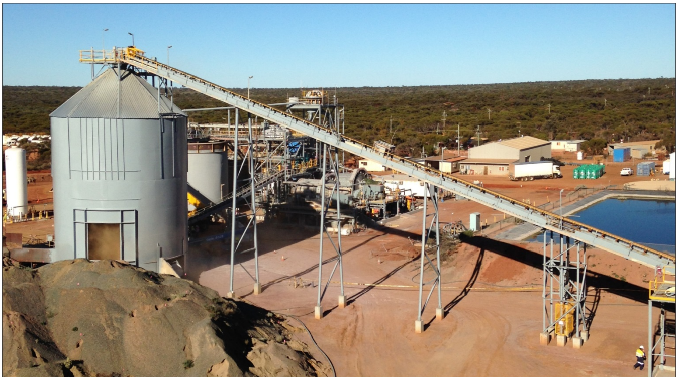
Overview of operating crushing circuit and refurbished fine ore bin receiving fine ore