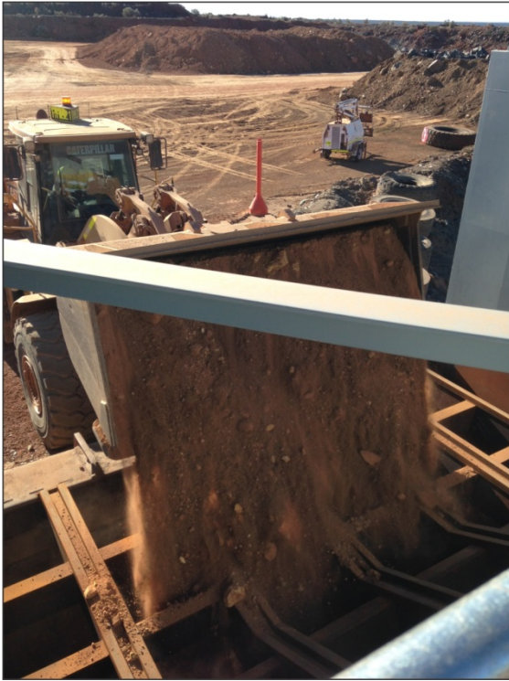
First ore being processed through crushing circuit (stockpiled ore in background)