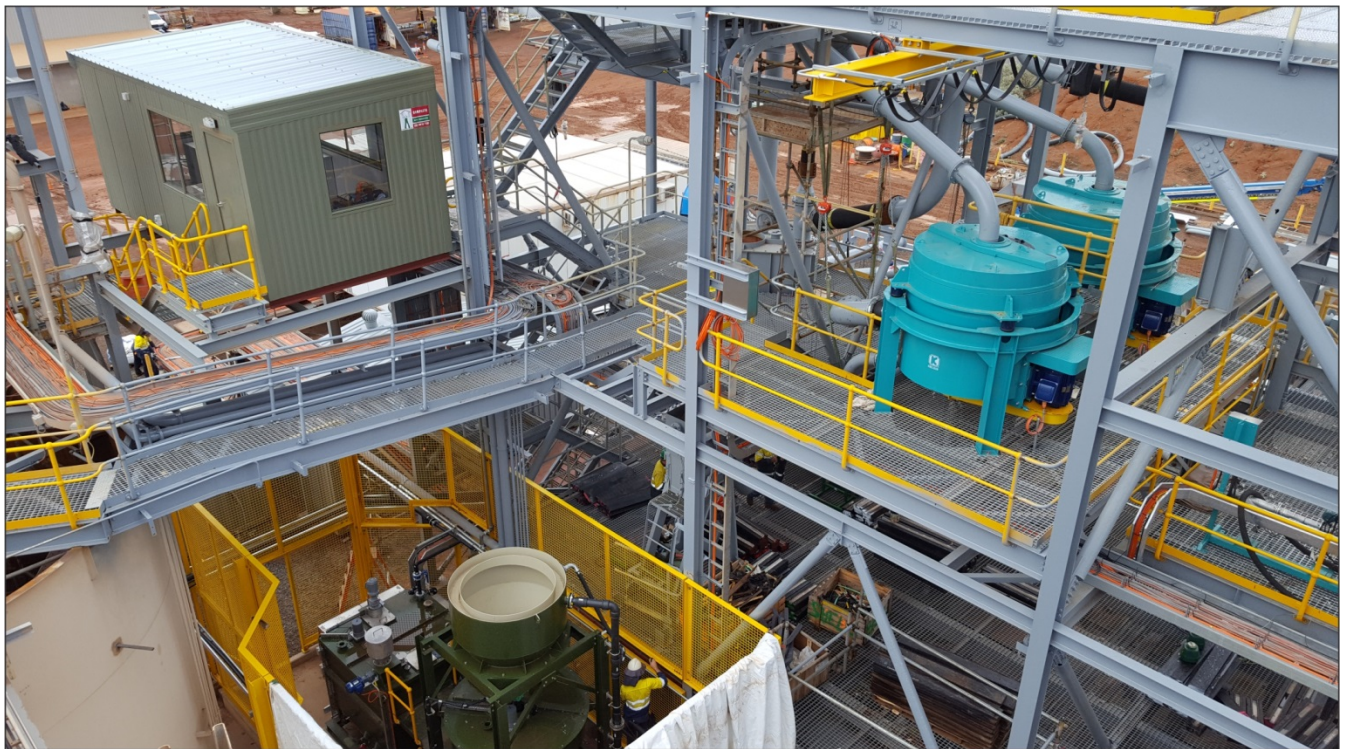
New mill control room, Nelson Concentrator and Acacia reactor installations.